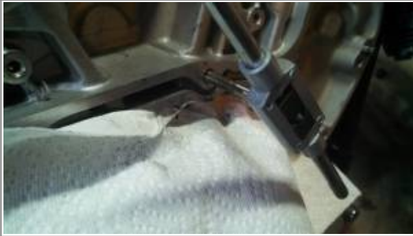
Chasing cam cover threads. 12)