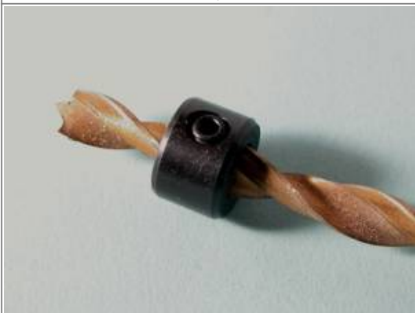
Drill Bit Stop Collar 16)

You can also remove the set screw and use the collar as a drill guide.